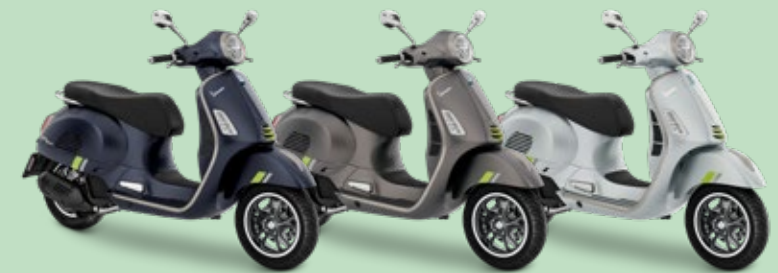
BLU ENERGICO OPACO